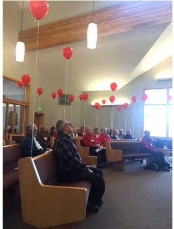
Red Balloons in celebration of Pentecost.